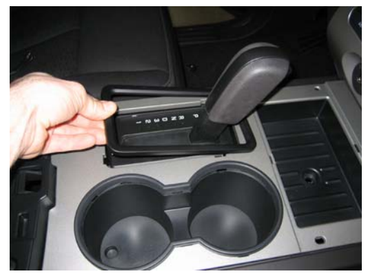
Replace the trim panel around gear shifter